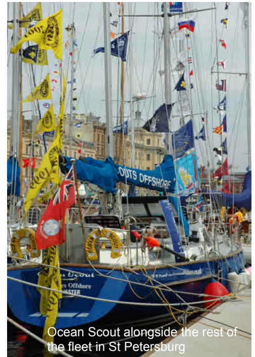
Ocean Scout alongside the rest of the fleet in St Petersburg