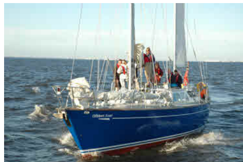
Offshore Scout at Sea