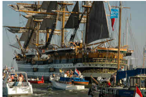
The mighty Amerigo Vespucci in Amsterdam

Next July, I'm part of the crew of the Tall Ships Race from Aalborg to Kristiansand.